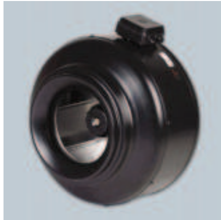
VENT-355 and VENT-400