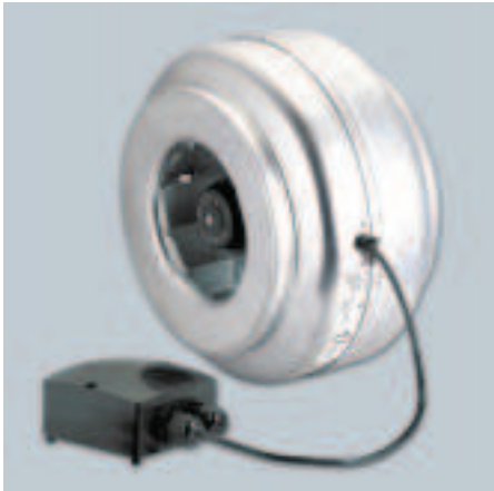
VENT-100 to VENT-315